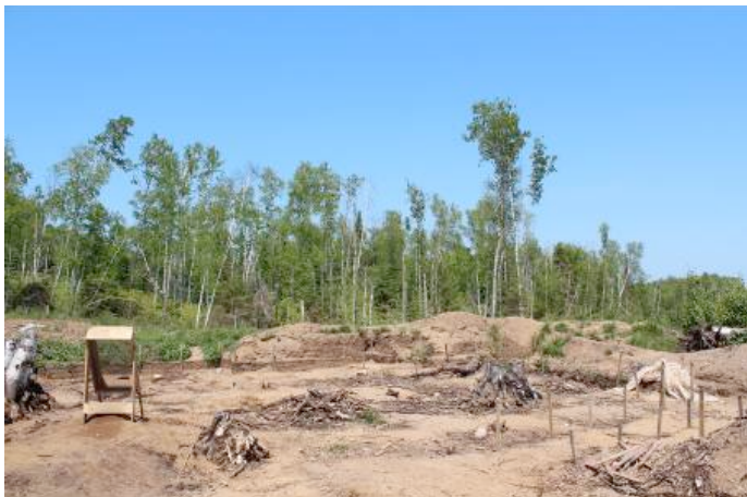
Figure 1: Mackenzie 1 looking northeast

Stepping out of the classroom and into the field can be a daunting experience. In the classroom professors speak of cultures from next door and across the world, and though their lectures are interesting, they can also seem quite distant. The theoretical and the practical can be disjointed but I have been fortunate enough to have had stepped into the field before I stepped foot into the university classroom. While the experience gave me a reference for comparison, the field school I attended was not a true reality of consulting and research archaeology. Throughout my undergraduate career I was able to have my foot in the academic world as well in the field. Until the summer of 2011, my field experience had been limited to a combination of contract and research archaeology as a summer student and through a variety of experience programs. I had no idea there was a whole other aspect of field archaeology of which I had no experience.