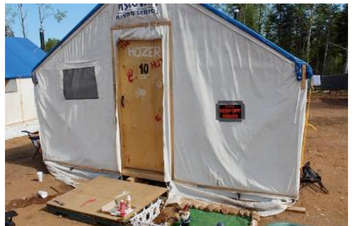
Figure 2: Mackenzie 1 looking NE from the centre of

There were several aspects of my new job that I found were completely new and some things that I had never thought that I would experience. These were both big and small and some easier to adjust to than others. The biggest adjustment was to the size - not just the size of the site, although it felt enormous - but the scale of the project itself. Prior to this field season I had worked on relatively small crews, thinking that 13 was a lot of people, and here I found myself in a crew of 60 plus people. It was a slightly overwhelming adjustment at first. The living situation was another adjustment altogether. I lived in a corner of a tent big enough to fit a single bed and a small amount of space along the side and end. I roomed with three other tent mates in one of several in our tent city, and it became our own little world. It didn't take long to adjust to camp life, but what I didn't anticipate was how difficult it would be to leave. The part of the job that I thought I would have the most difficulty dealing with, as I am traditionally not overly social, ended up being one of the best experiences of the season.