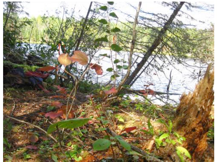
Figure 4: Taken on an excursion to Red Lake Ontario for Stage 2

There was no backhoe archaeology, and in fact it was all very meticulous. I consider myself lucky to have worked with a company that cared about the research that could be done with what we were digging up. One very pleasant surprise of the work was the involvement of Native bands in the excavation. It was one of the greatest learning experiences that I could have imagined, as I had been taught that archaeology had traditionally been a white middle class profession. It was a pleasure to see that things are changing and I was happy to learn what archaeology meant to the people whose history I was uncovering and had the pleasure of sharing with them what archaeology means to me.