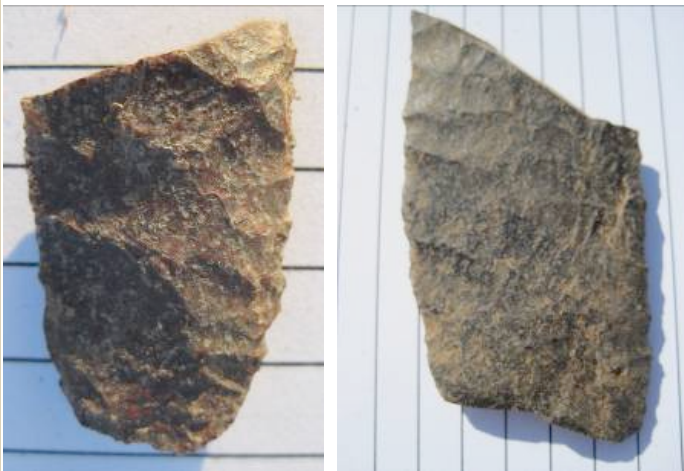
Figure 3: Knife fragment, approximately 4cm tall (left), Point midsection, approx. 10cm tall (right)

Throughout my undergraduate career I learned about PalaeoIndian sites and, as I have noted, what I had learned did not match what I saw before me. Some aspects of my expectations were met but others fell a little flat. I had heard stories of what would happen when a projectile point was found at one of the sites, of all the celebration that would occur, but what made this site so special and such a draw for so many people negated this expectation. I remember I found the first point of the season, something I was quite proud of. Not long after that another point was found and then another and another, without the pomp and circumstance I had expected. Although I shouldn't really be disappointed, I found my fair share of the points and other tools that came up during the season. I had never thought that I would have the opportunity, considering my impression of PalaeoIndian sites, to find a point that was possibly over 9000 years old. To hold something like that in my hand was a very humbling experience, and in my limited flintknapping experience I couldn't hold a candle to the skill needed to make the tools that we were finding.